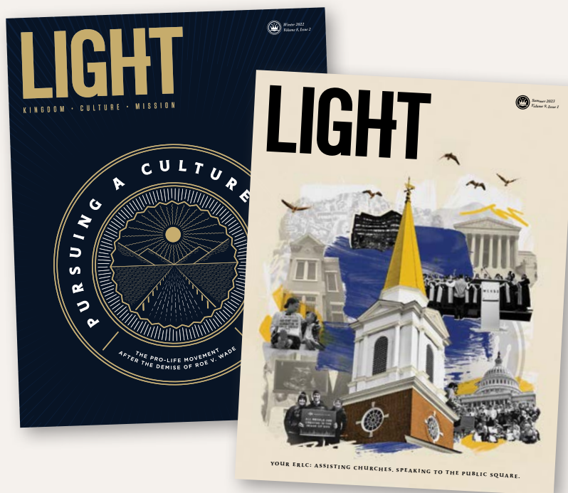
The latest issues of the ERLC's biannual magazine cover pro-life work after Dobbs and the mission of the ERLC.

exploitation of migrant children, and covered the launching of a private refugee sponsorship program in the U.S.